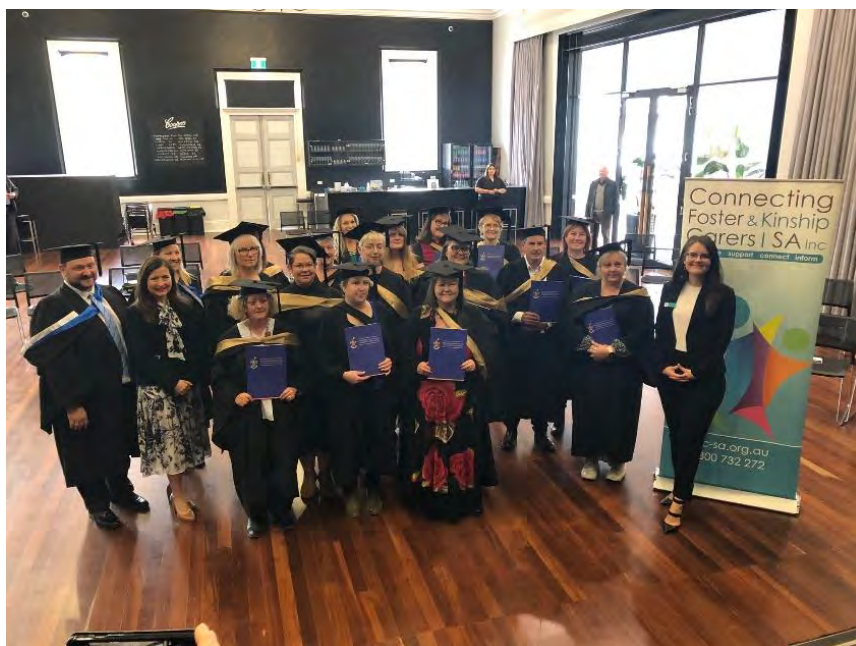
(left) Diploma of Community Services cohort 2 graduates: Oct 2020

CF&KC-SA wishes to thank the Bradford Institute for continuing to facilitate this bespoke opportunity for our Carers, and pursuing subsidies for our students offered through the Skilling SA Initiative offered by The South Australian Department for Innovation and Skills.