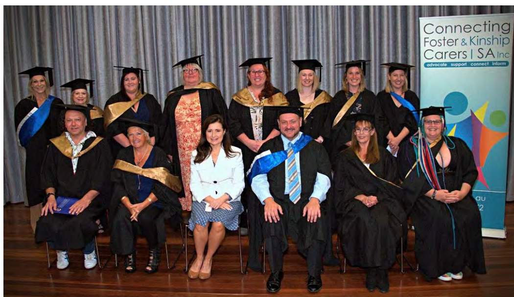
(above) Diploma of Community Services cohort 3 graduates: March 2021

As the peak body for Carers, we are extremely proud to have facilitated this initiative for our Carer membership – the first of its kind in SA and one which recognises the unique skills and experiences that Carers bring. The course has been life changing for some Carers some of whom never believed they would complete a post school qualification. It has led some Carers to paid employment, some beginning their own businesses, others to further study - and has (in many cases) inspired the children and young people in their care.