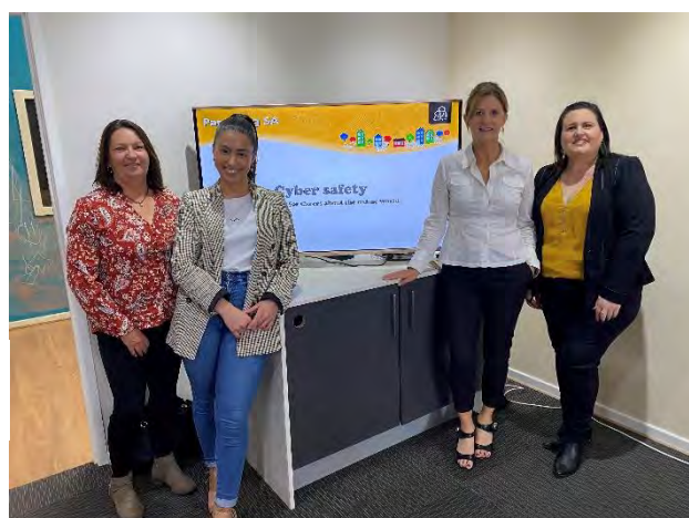
(right) Parenting SA Cyber Safety Carer Information Session