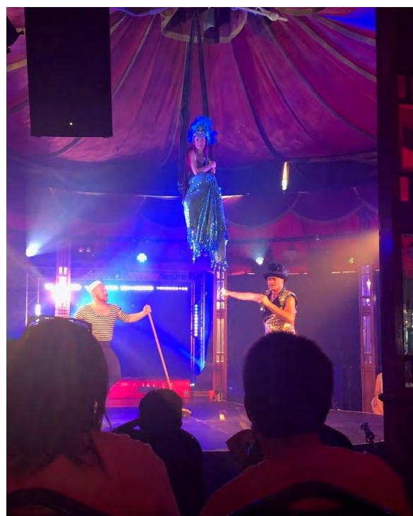
(above) Fringe community event for Carers: March 2021 "A Mermaids Tale"